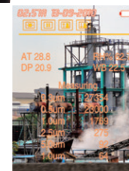
Fold reading on the images