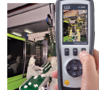
JPG images/AVI videos